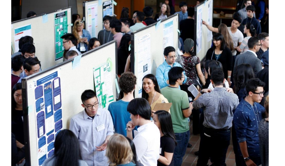
CHEM 341 Poster Session, Winter 2014